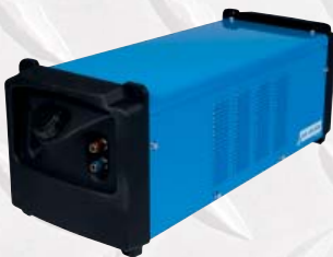
Cooler III Unit System