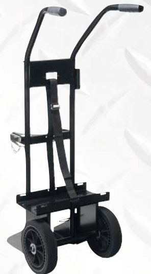
Universal Trolley W000375730