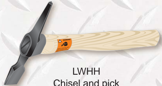
LWHH Chisel and pick Hickony Handle