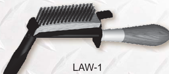
LAW-1 Hammer and brush Wood Handle