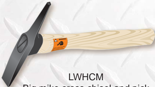
LWHCM Big mike cross chisel and pick Hickony Handle