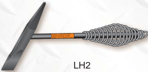
LH2 Chisel and pick Spring Handle