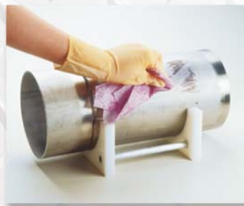
Step 2 Use abrasive side of the wipe to remove contaminants from pipe.