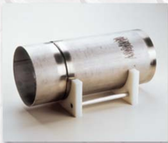
Step 1 Remove the wipe from the pouch.