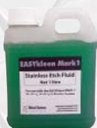
Etching Solution EKM1ESOL-250W EKM1ESOL-1W