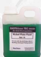
Nickel Plate Solution EKM1CPSOL-250W EKM1CPSOL-1W