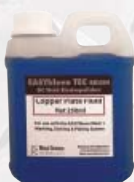
Plating Solution EKM1CPSOL-250W EKM1CPSOL-1W