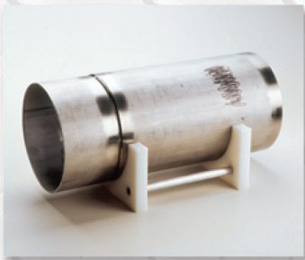
Step 1 Remove the wipe from the pouch.