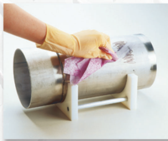
Step 2 Use abrasive side of the wipe to remove contaminants from pipe.