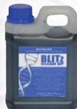
MST128 Neutraliser 1 Litre