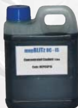
MEPI5SP10 Coolant 1 Litre