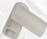
152MEP Bristle Sleeve