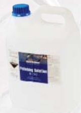
102MEP 103-20MEP Polishing Solutions