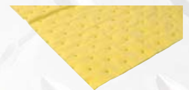
TC354 Absorbent Mat