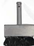
MEPI5M120W M120 Fed Brush