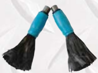
151MEP P1 Brush