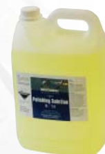
153MEP Polishing Solution 5 Litres