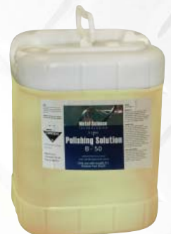
153-20MEP Polishing Solution 20 Litres