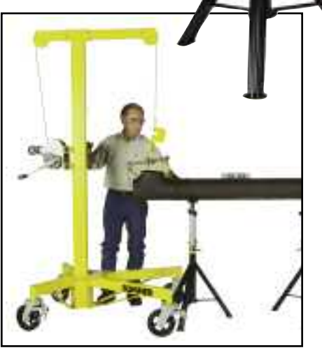
Position fittings with Sumner Adjust-A-Fit