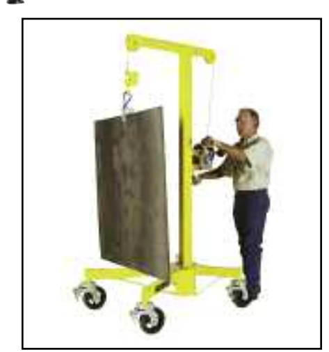
Move plate with plate lifting clamp