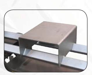
Bed Table 785580