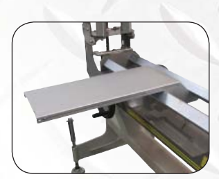
Side Table 785560