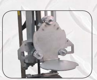
Chuck Table 785585