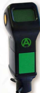
ARGON NAUGHT (IMAGE REFERENCE ONLY)