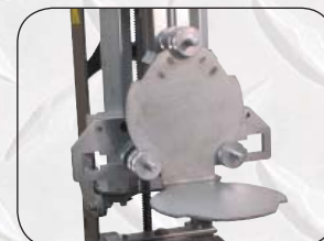
Chuck Table 785585