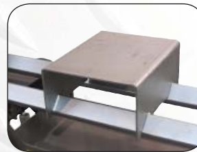
Bed Table 785580