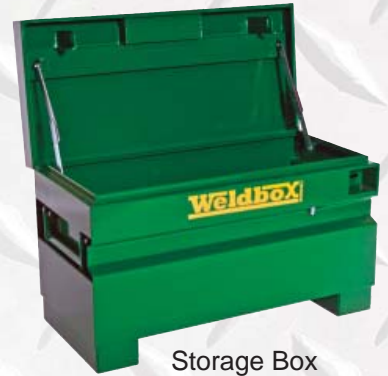
Storage Box 779928