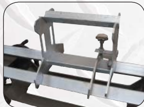
Vee Table 785565