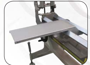
Side Table 785560