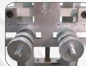
Chuck Nuts 785455