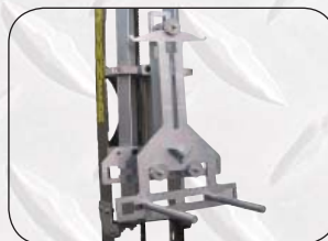
Chuck Adaptor Plate 785550