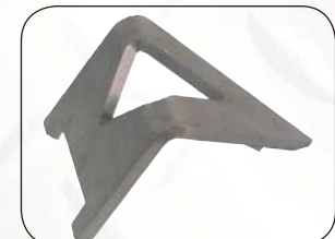
Wedge Support 785578